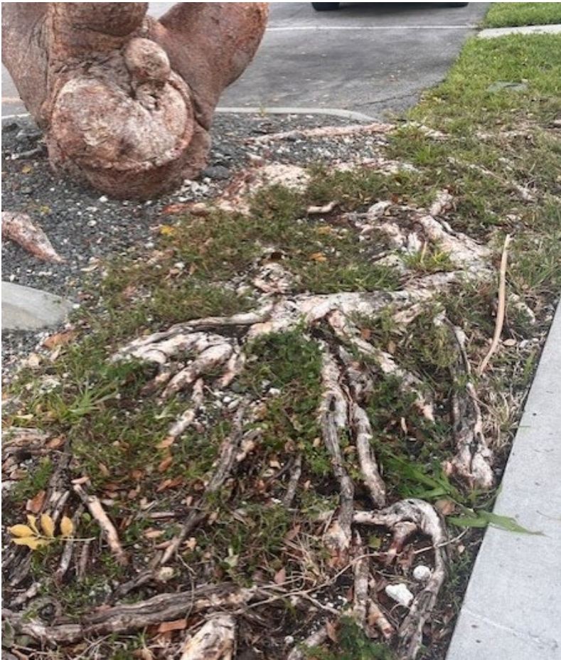
Outside #4 – Cover opportunity