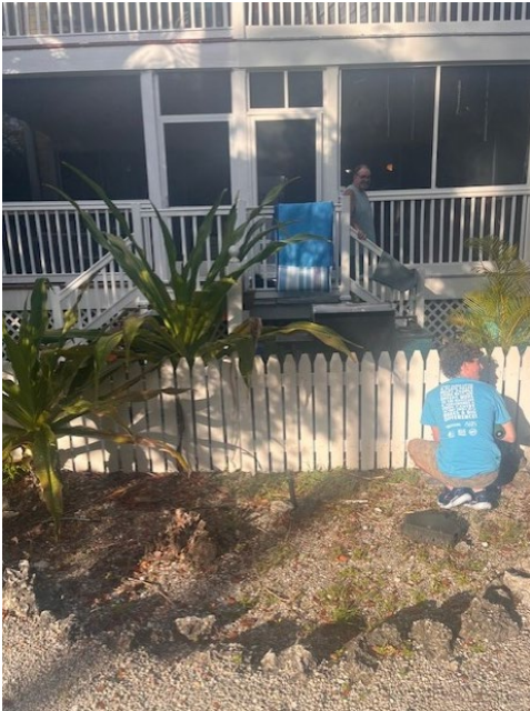
Behine #106 Golf Club Drive – Opportunity for Planting