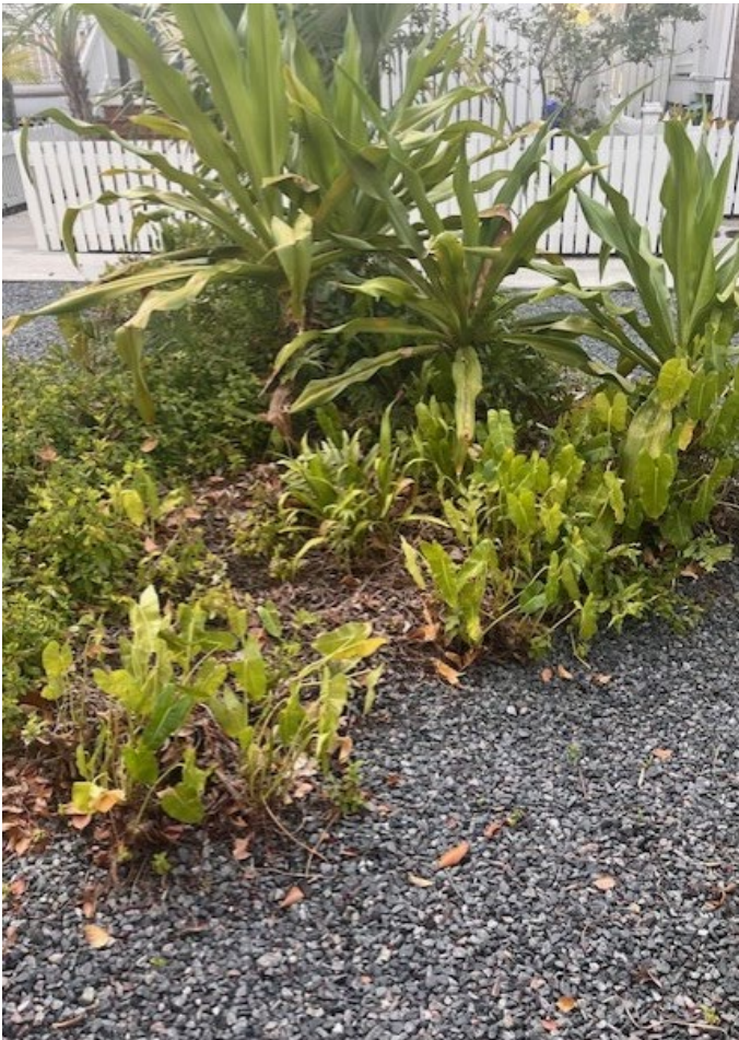
Outside #71 – Fix Coverage