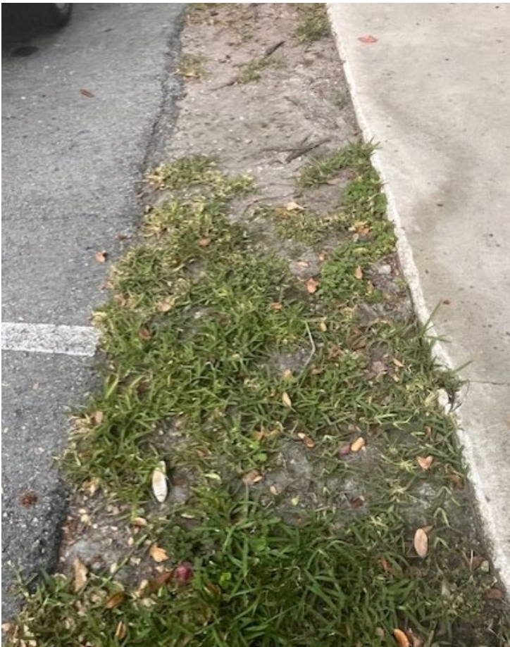
Outside #54 GCD