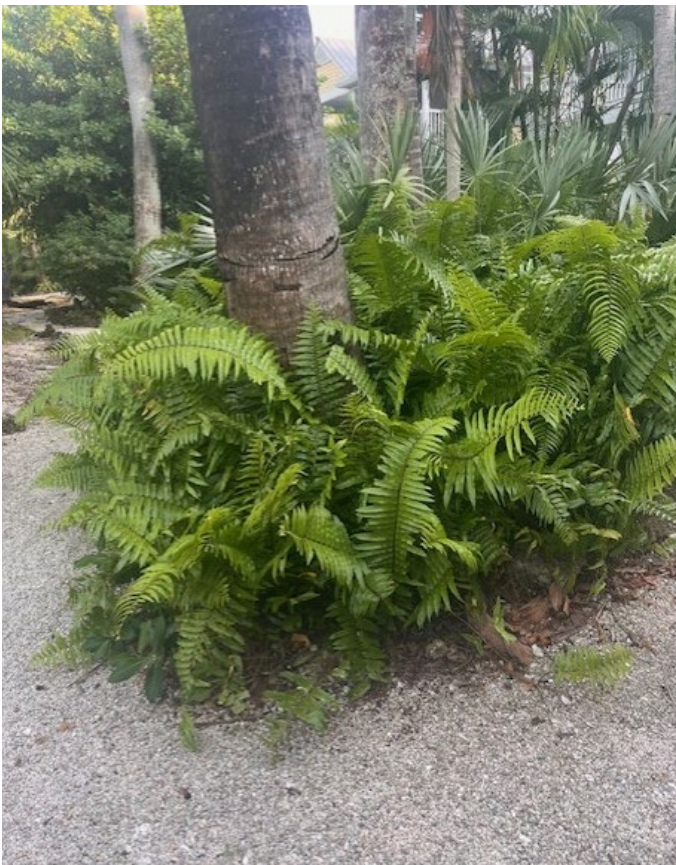
Good plant for coverage – Grows well minimal maintenance