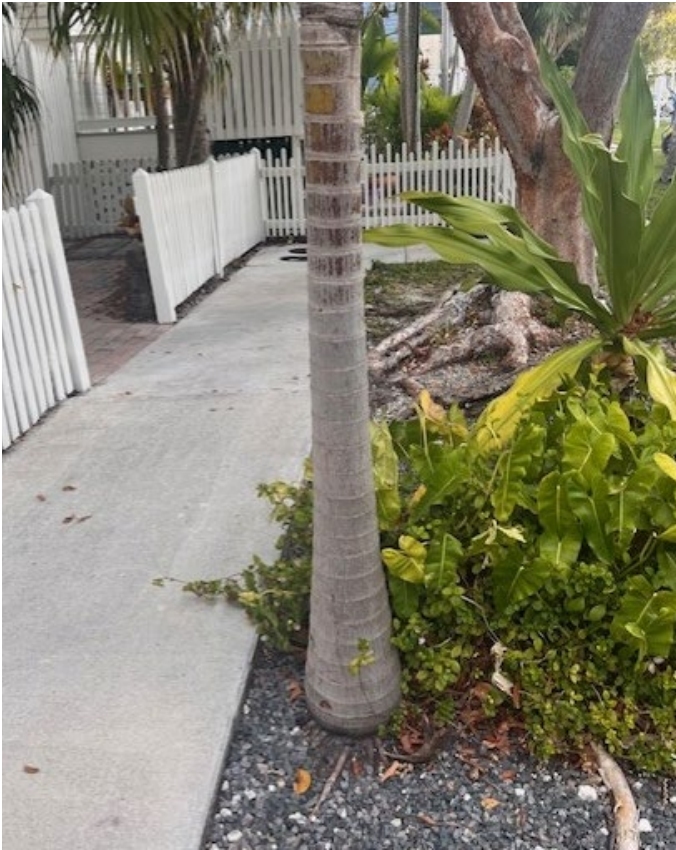
Outside #44/2 – Remove Stump