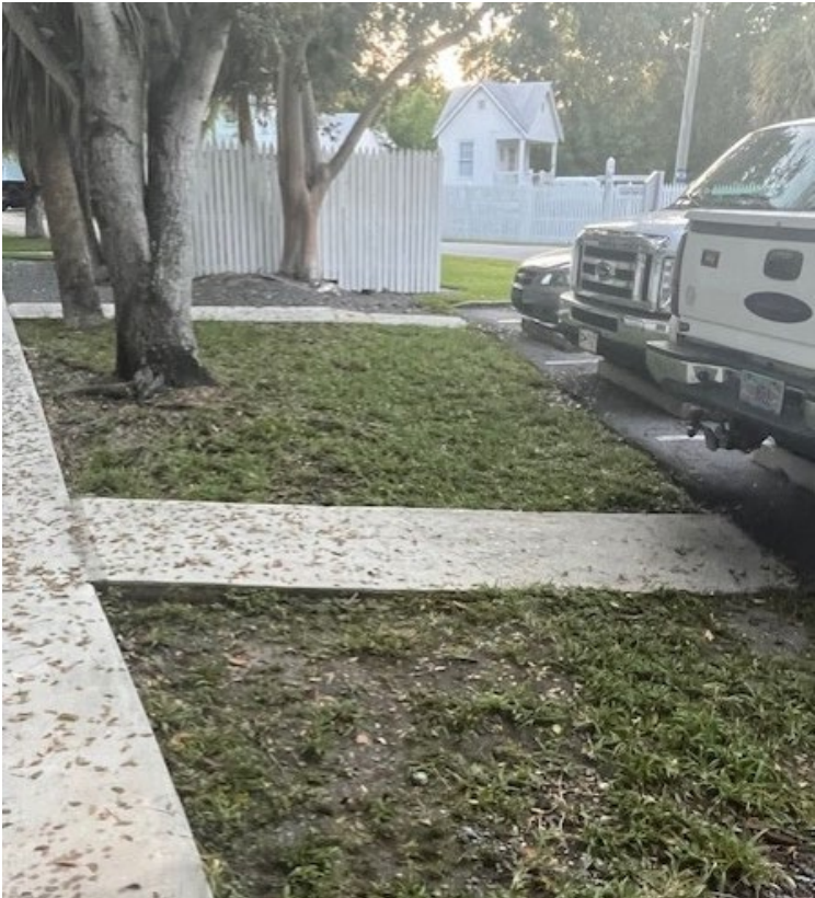
Outside #4 Kestral