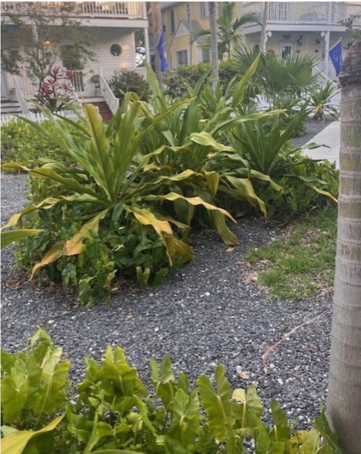
End of Spoonbill – Change Rock Color – This is also in the Survey that they do not like the appearance of the gray rock.