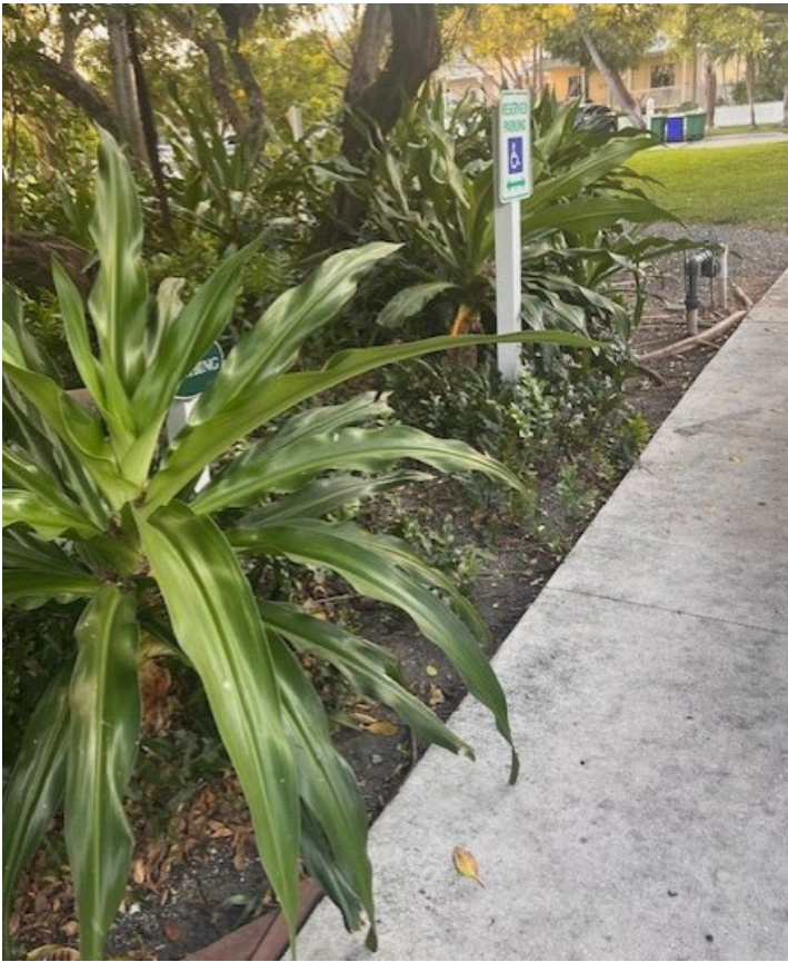
Opposite #28 Kestrel – Ground Cover