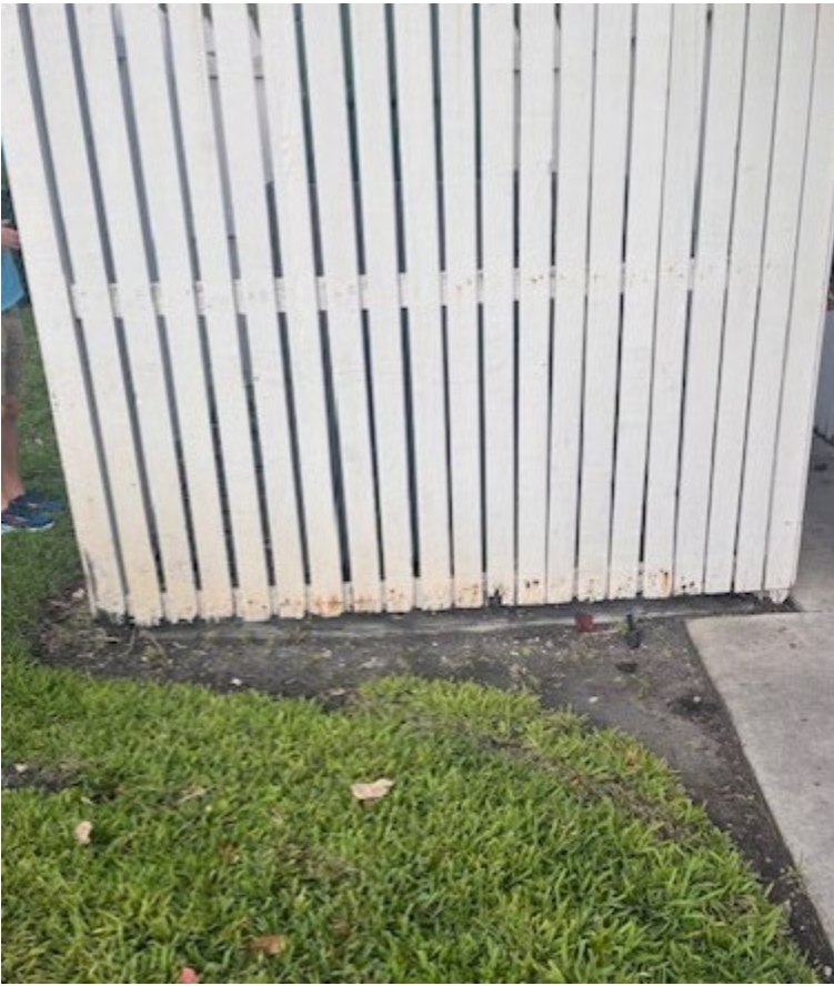
Outside #1 Kestral Enclosure