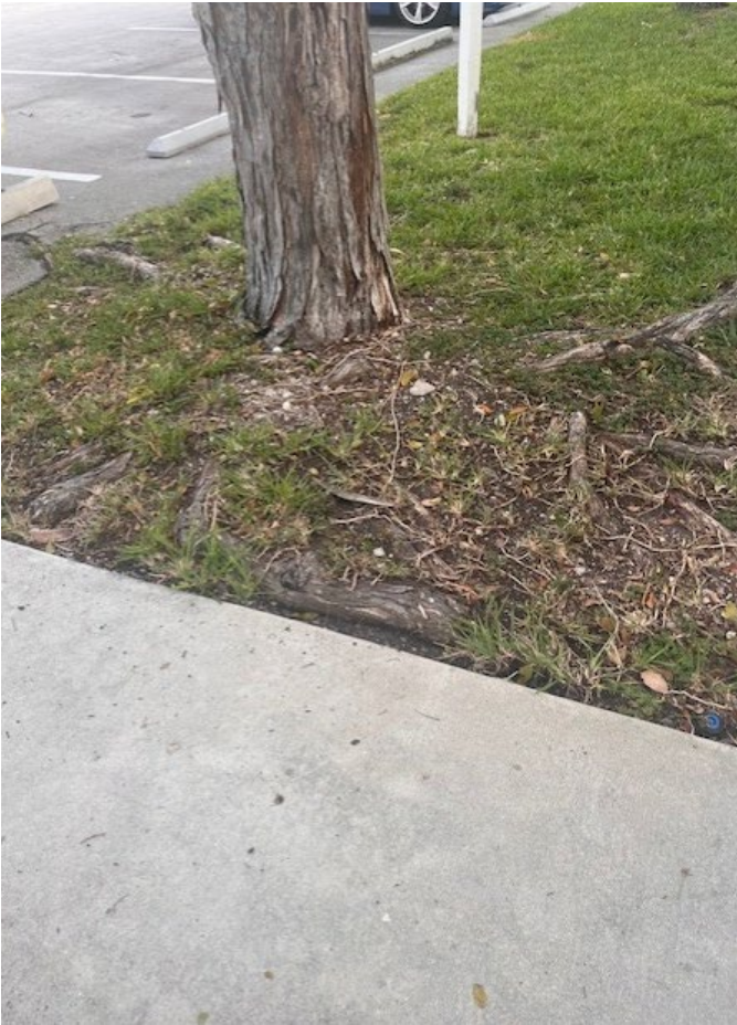
Outside #32 – Ground Cover