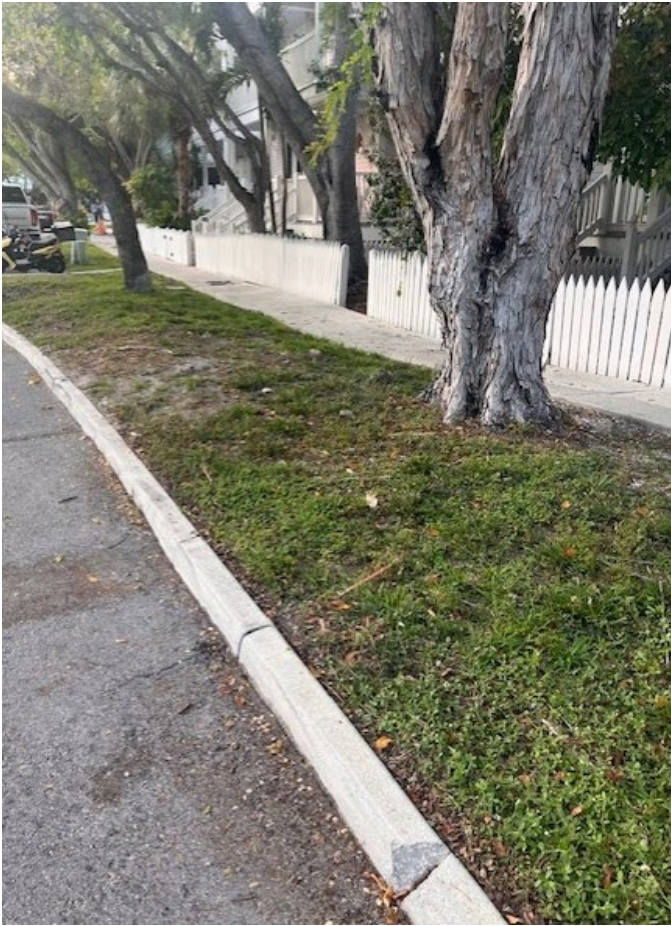
Outside #65 GCD – Ground Cover