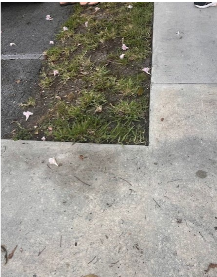
Outside #10 – Ground Cover