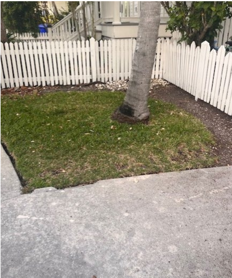
Outside #67/1 Corner Rocks