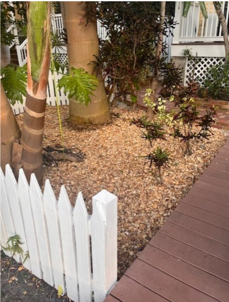
Example of pretty rock #13 Kestral