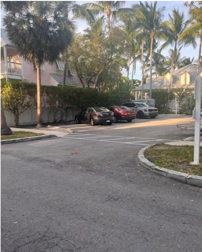
(2) Photos of Guest Parking at #26 needing improvement