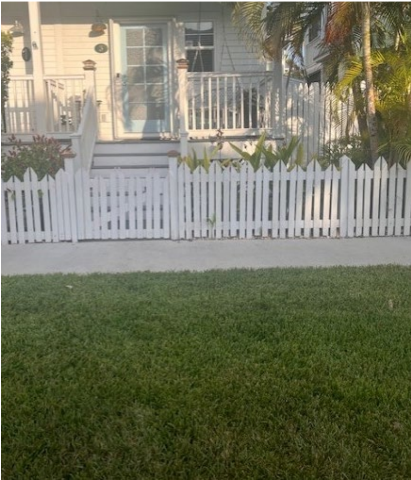
Outside #3 – Tree permitted, not planted