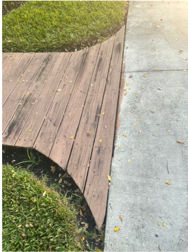
Walkway Damage Outside #11 needs repair