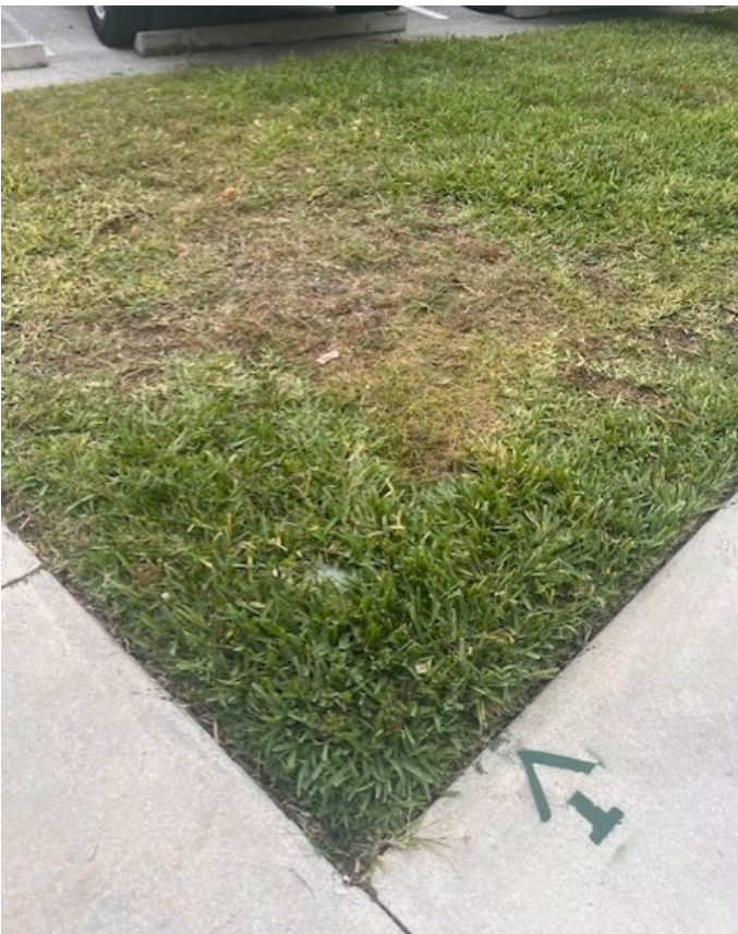
Outside #42/2 Ground Cover