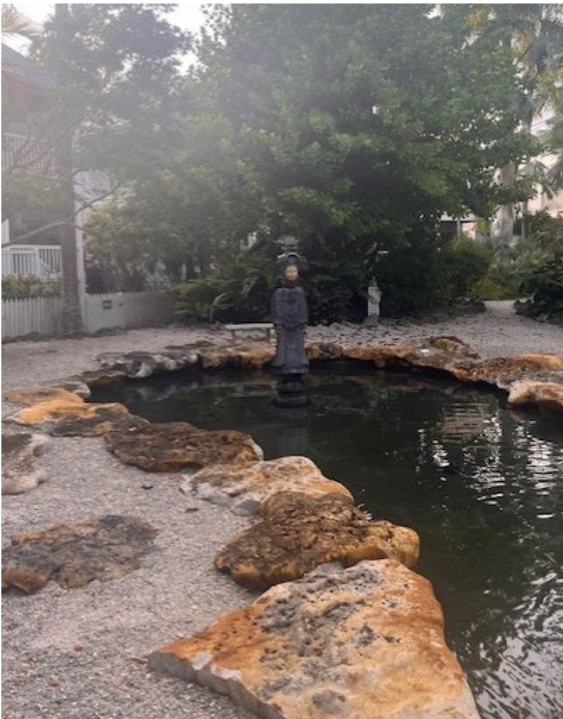
Replace Statue with more appropriate them for