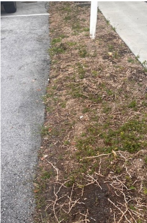
Outside #2 – Ground cover needed