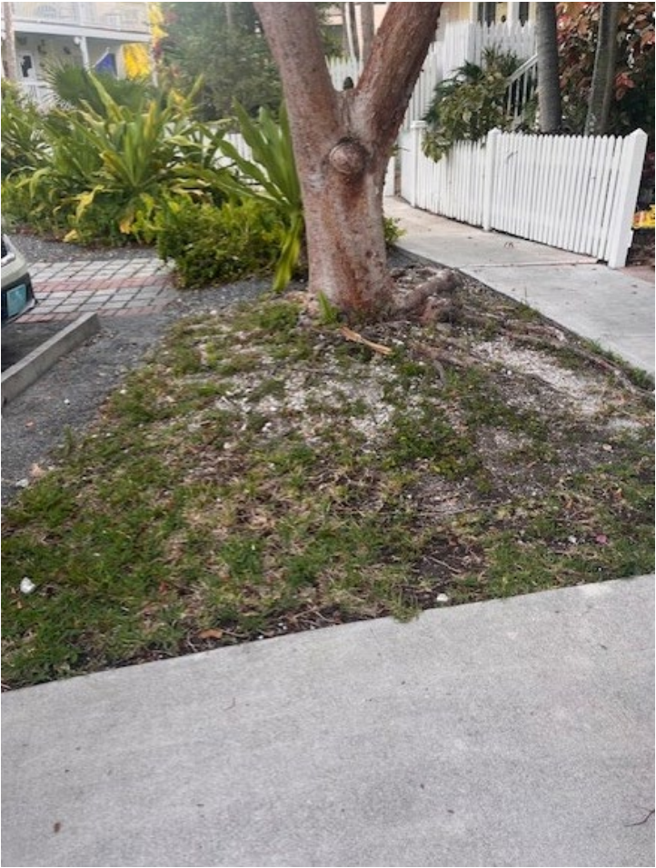
Outside #44/2 Ground Cover